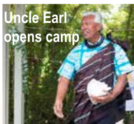
Uncle Earl opens camp

Camp Erin® HAWAII is a free, weekend bereavement camp for youth who are grieving the death of a significant person in their lives.